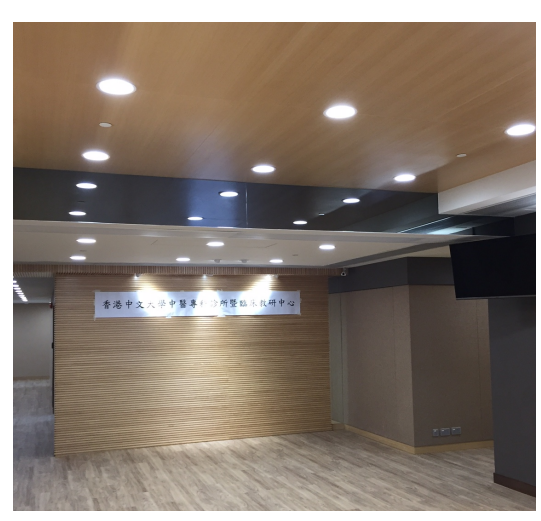
Our Job Reference: 香港中文大學中醫專科診所暨臨床教研中心